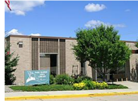
PARK RAPIDS AREA LIBRARY 2013

210 West 1 st Street Park Rapids MN 56470 Phone/fax: (218)732-4966 Web Catalog: www.krls.org