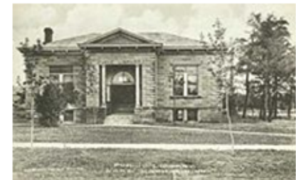
PARK RAPIDS PUBLIC LIBRARY ca.1910